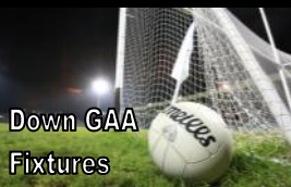
Down GAA Fixtures

By now all Clubs will have their All-County Football League fixtures and the Calendar of nights for the Incoming Season. Hopefully all run according to schedule.