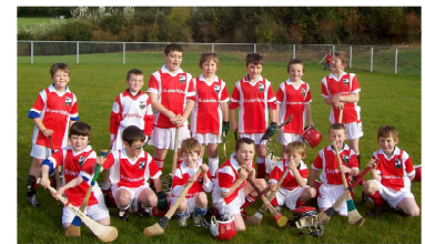
Our U-12/10's Hurlers At A Recent Tournament In Carryduff, further photos on the Club Website.